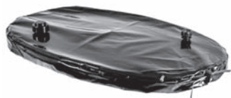
Close fitting lid

To make it easier for the installer and help ensure installation complies with the water regulations, we have updated our range and now supply our most popular cisterns with kits.