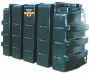
OIL & FUEL TANKS