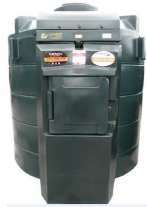
6000 FUEL POINT