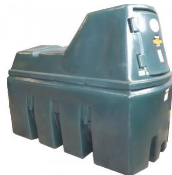
2500 FUEL KING