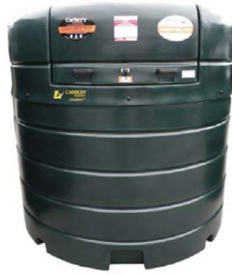
2500 FUEL POINT