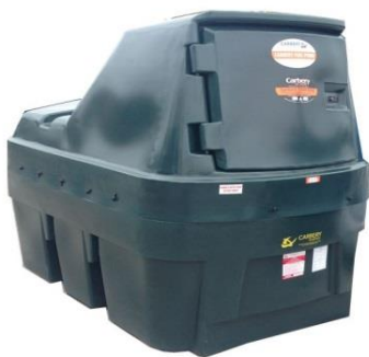
1350 FUEL KING