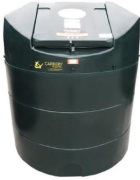
1350 FUEL POINT