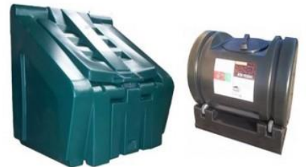
HOME & GARDEN